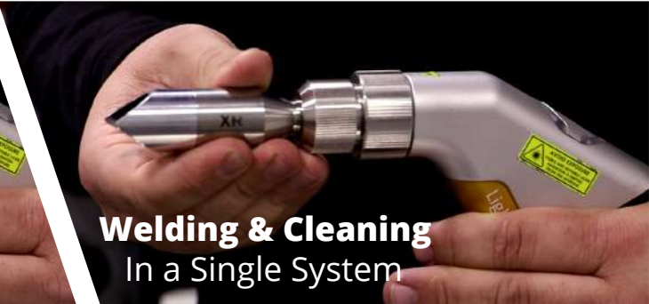
Welding & Cleaning In a Single System

Switching between welding and cleaning is fast and easy. Simply loosen the collet, insert the welding or cleaning nozzle, select a preset from the front panel, and the system is ready to clean or weld.