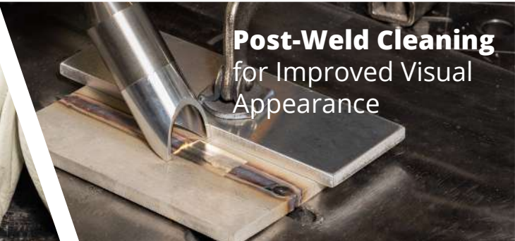
Post-Weld Cleaning for Improved Visual Appearance

LightWELD is powerful enough to melt metal and create a weld pool even if contaminants are present. However, to improve weld quality and reduce porosity, best results are attained by pre-cleaning to remove any oil, grease, or any debris that could enter the weld pool and create a defect.