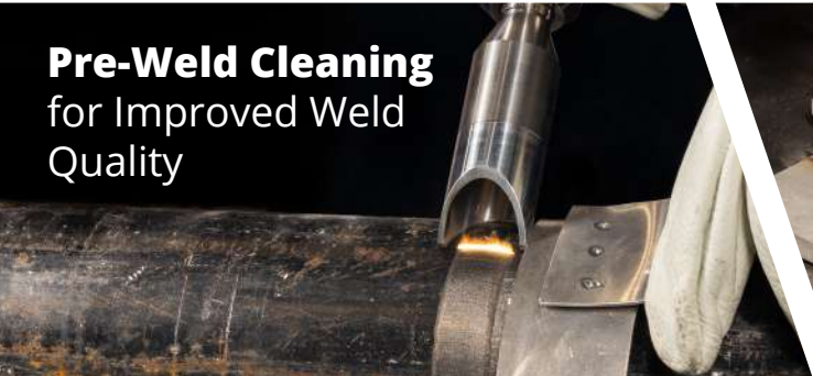
Pre-Weld Cleaning for Improved Weld Quality

LightWELD XR easily welds steel, stainless steel, aluminum, titanium, copper, and nickel alloys without part deformation. Preset modes ensure proper laser settings for consistent high-quality welds. Built-in wobble function accommodates wider seams, while wire welding capability extends welding application to poorly fit up parts.