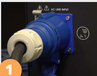
220 V Power