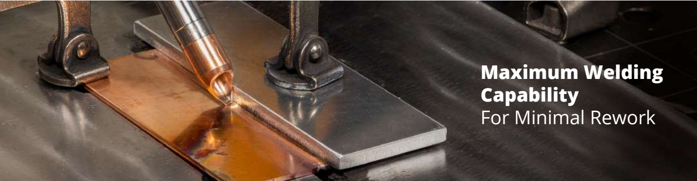
Maximum Welding Capability For Minimal Rework

LightWELD built-in optimized presets provide high-quality, consistent welds for any skill level. LightWELD XC and LightWELD XR offer the added functionality of pre- and post-weld cleaning. Pre-weld cleaning removes oil, grease, paint, or any potential contaminants that can affect weld quality. Post-weld cleaning creates visually appealing welds while eliminating need for post processing